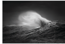
Nyx 30" x 45" Photograph Archival Pigment Print Edition 8/12 Framed 33.5" x 48.5" $5,300