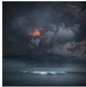
Fire Within 38" x 38" Photograph Archival Pigment Print Edition 9/12 Framed 41.5" x 41.5" $10,000