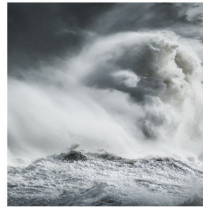
Titans 8" x 8" Photograph Archival Pigment Print Edition 1/12 Framed 11" x 11" $700