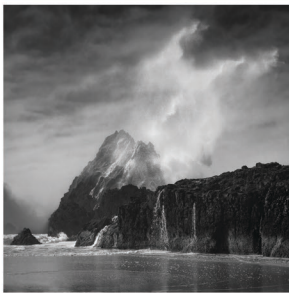
Lost World 38" x 38" Photograph Archival Pigment Print Edition 1/12 Framed 41.5" x 41.5" $5,800