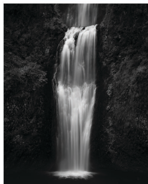
Multnohna 25" x 20" Photograph Archival Pigment Print Edition 2/24 Framed 28" x 23" $1,700