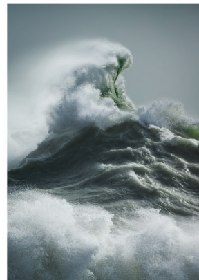
Sedna 53" x 38" Photograph Archival Pigment Print Edition AP 3/3 (last print) Framed 57" x 41.5" $16,000