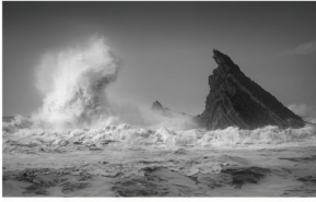
Face Off 30" x 48" Photograph Archival Pigment Print Edition 2/12: Framed 33.5" x 51.5" $4,800