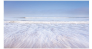
Break of Day 30" x 53.3" Photograph Archival Pigment Print Edition 2/12 Framed 33.5" x 57" $4,900