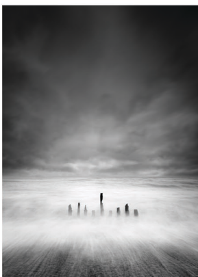
Resilience 28" x 20" Photograph Archival Pigment Print Edition 2/12 Framed 31" x 23" $1,700