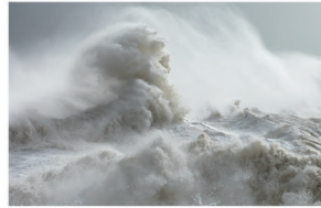
White Walker 37.5" x 58" Photograph Archival Pigment Print Edition 1/12 Framed 41" x 61.5" $5,900