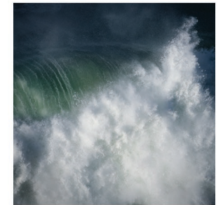
Surf Study IX 11" x 11" Photograph Archival Pigment Print Edition 1/24 Framed 13" x 13" $700